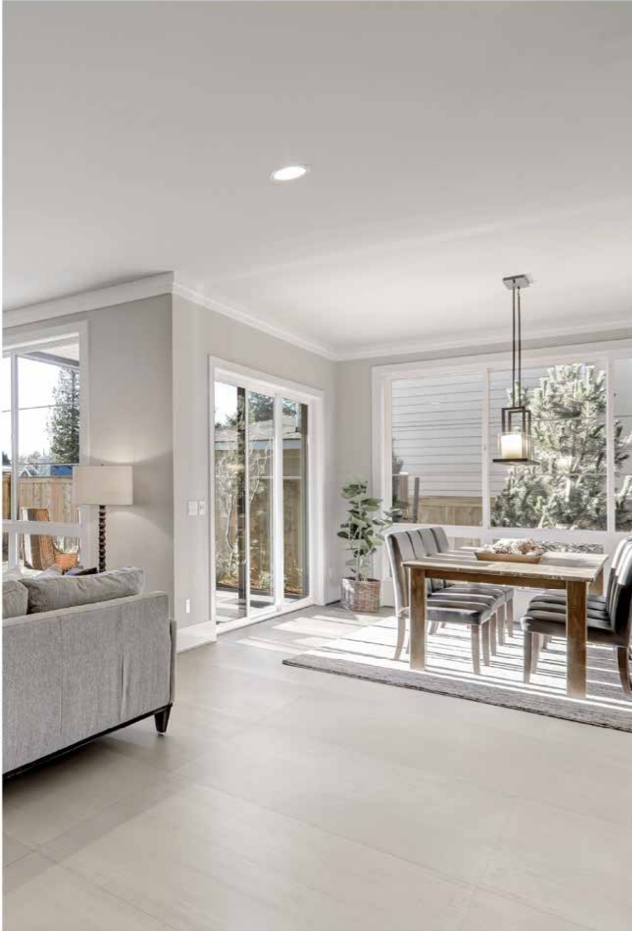
ORGANIC RUG BONE