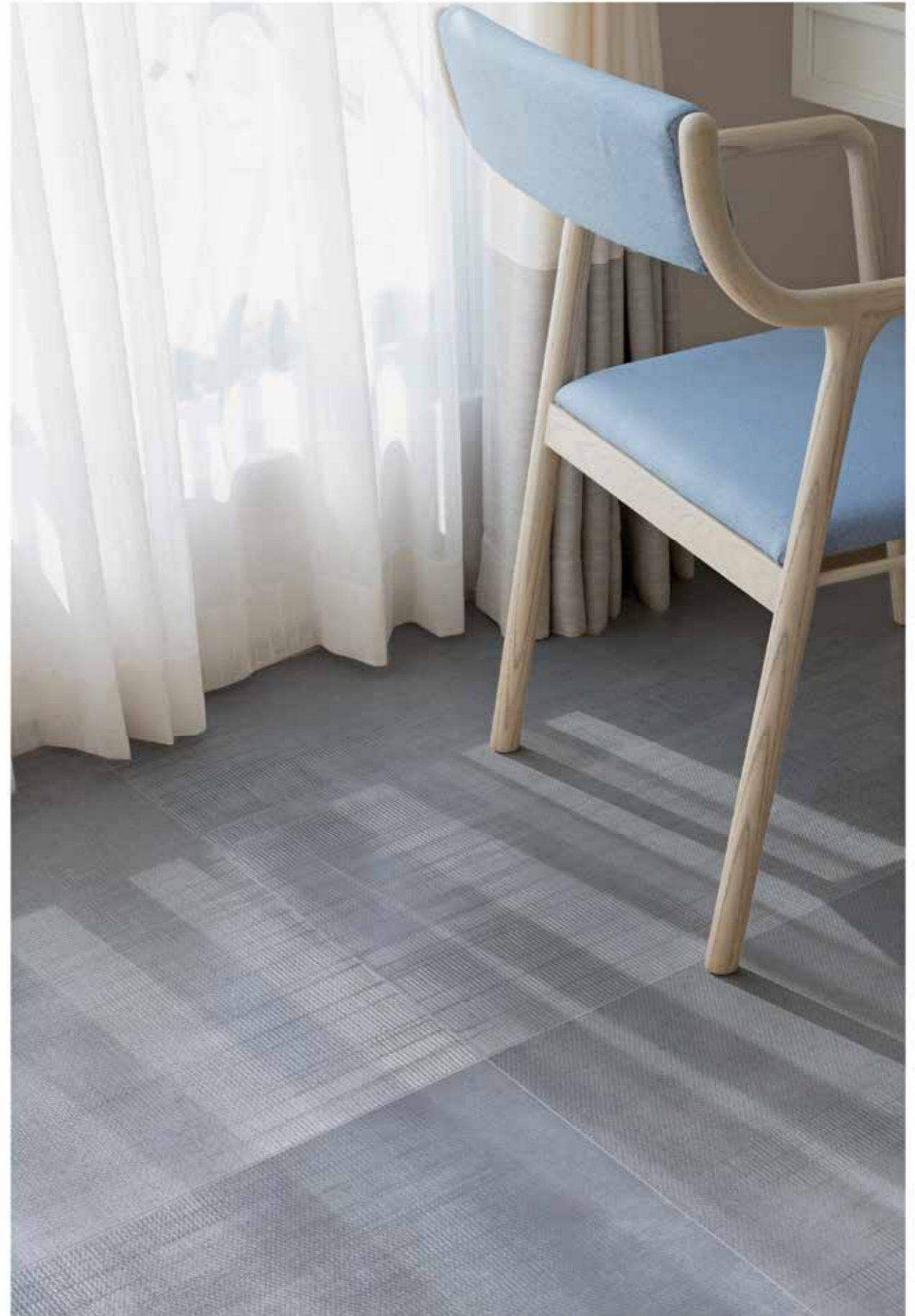
ORGANIC RUG DENIM