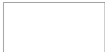
60x120 . 24"x48" RETTIFICATO