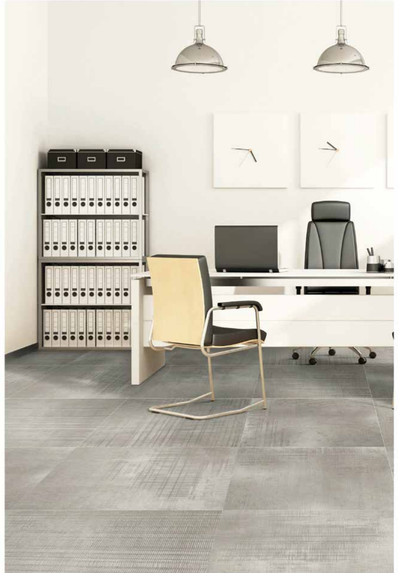
ORGANIC RUG SMOKE