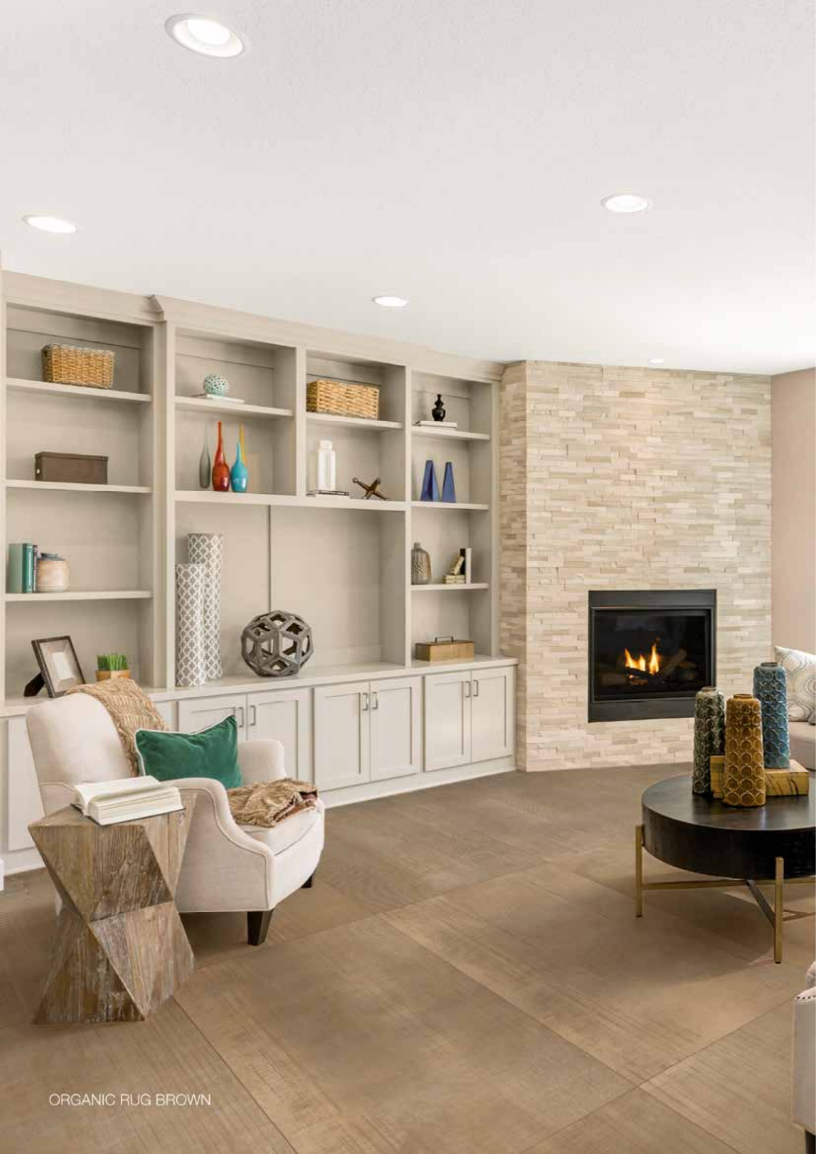
ORGANIC RUG BROWN