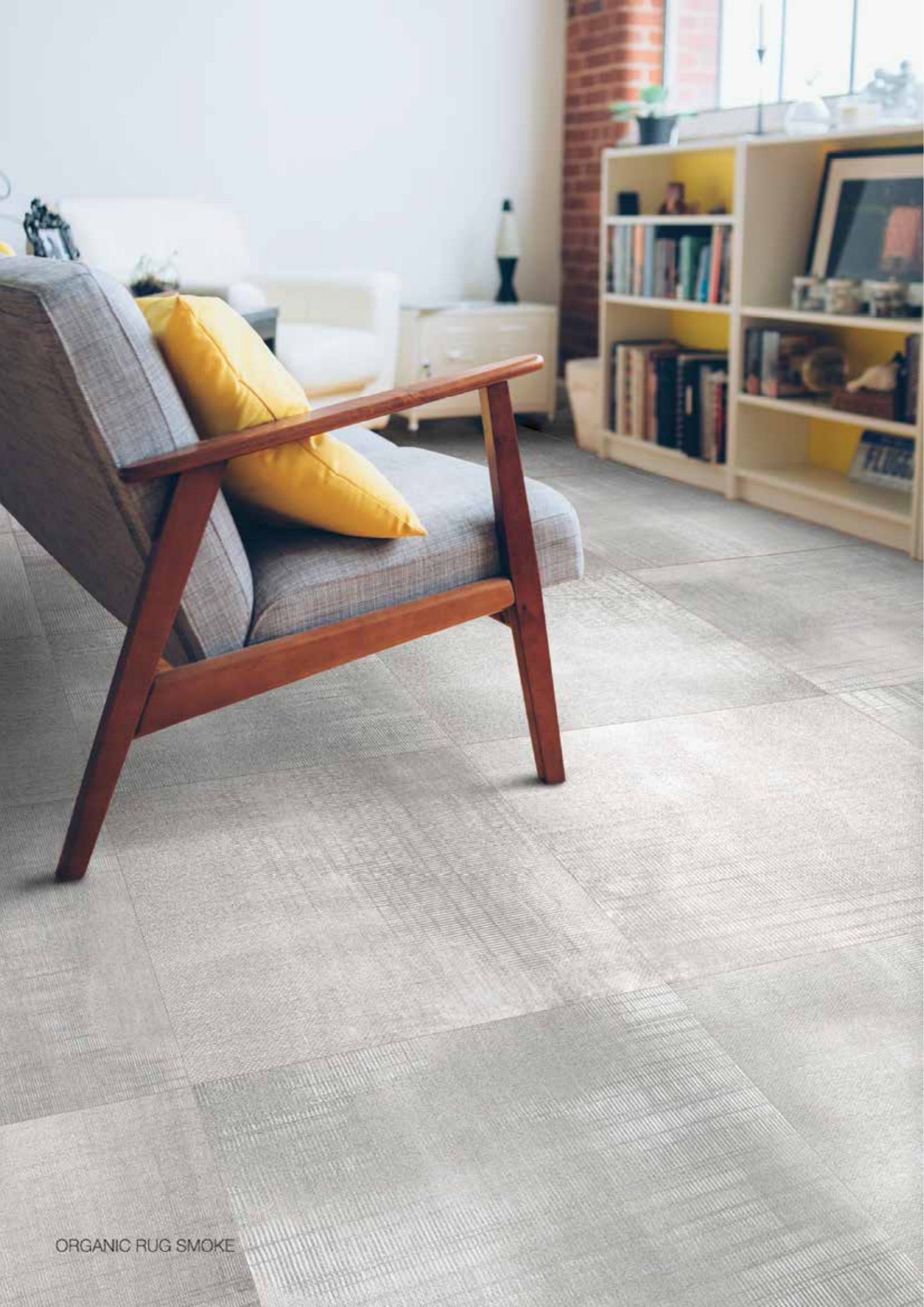
ORGANIC RUG SMOKE