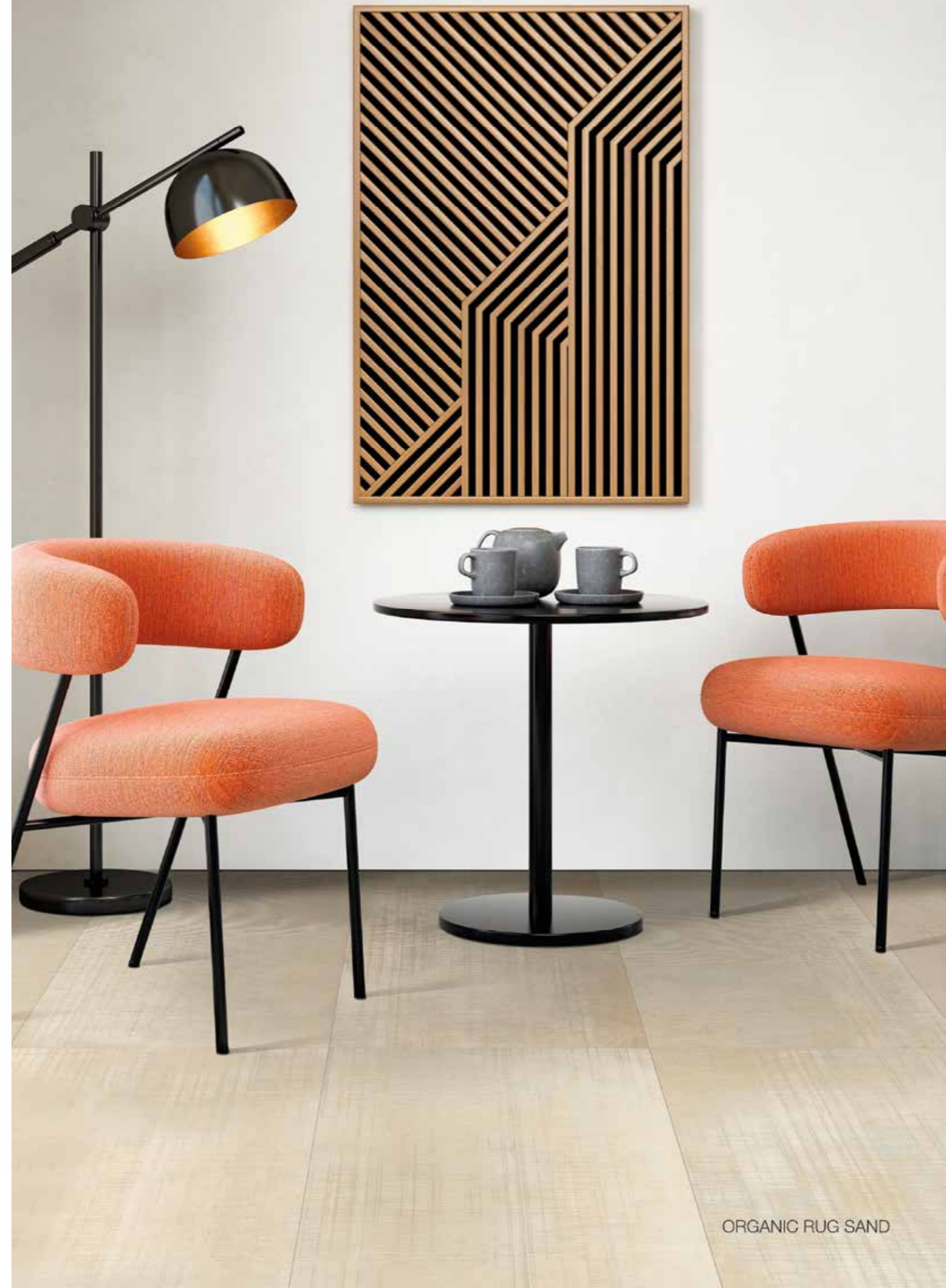
ORGANIC RUG SAND